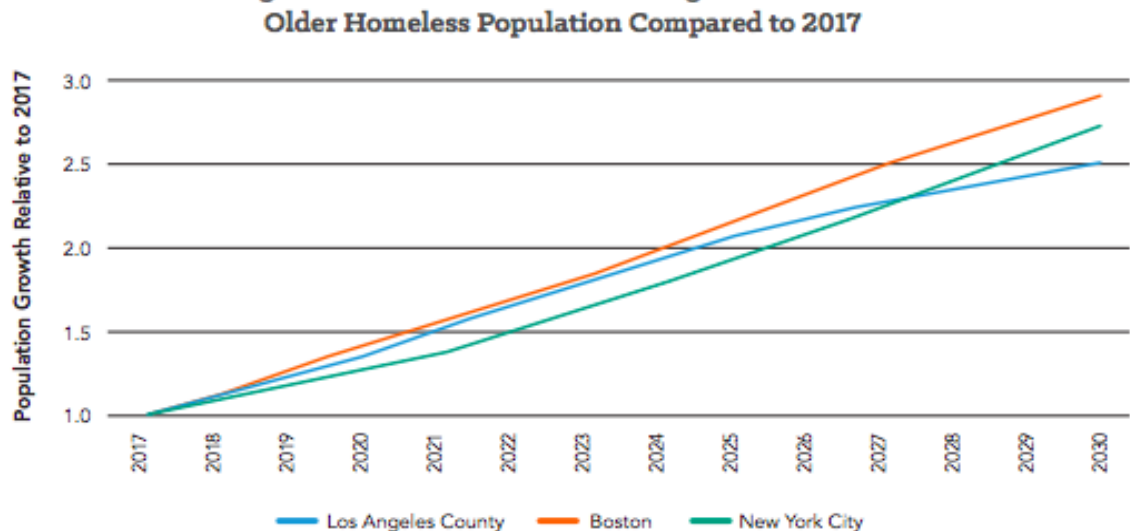
Figure 2: Forecasted Relative Change in the 65 and