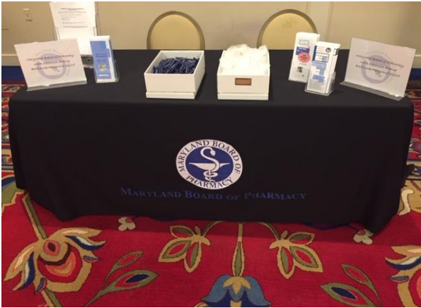
MD BOP Table at Mid-Year Regional Meeting for APHA