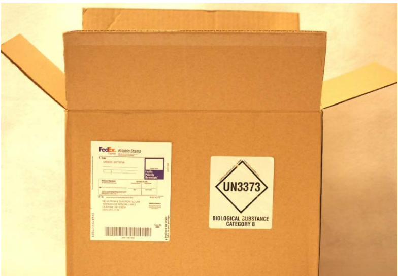
University of New Hampshire https://nhvdl.unh.edu/sending-specimens