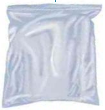
Sealed Plastic Bag