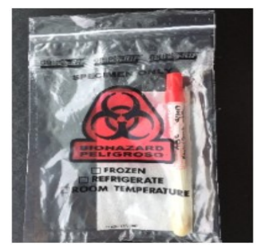
Acceptable packaging of swab in one bag