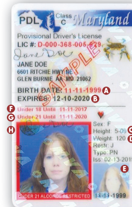
UNDER 21 DRIVER'S LICENSE (VER. 1)