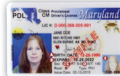
OVER 21 DRIVER'S LICENSE (VER. 1)