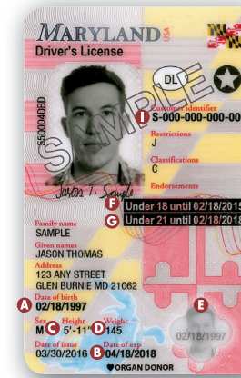
UNDER 21 DRIVER'S LICENSE (VER. 2)